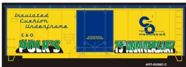
C&O "GREEN" Plug-Door Boxcar