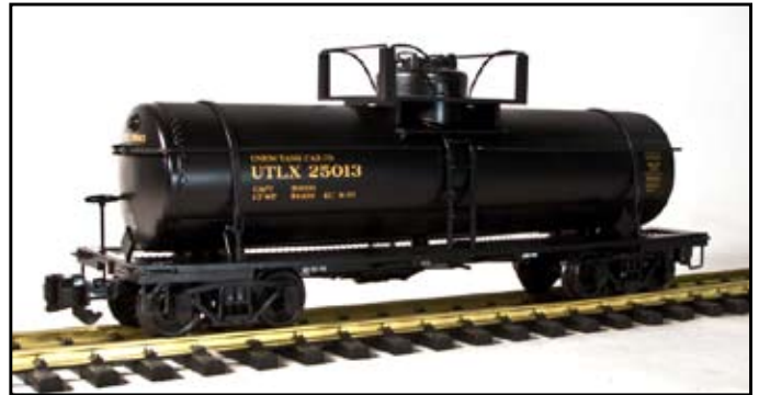
ART41336 - UTLX