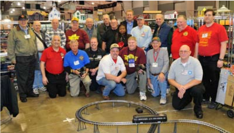
Aristo-Craft Forum members pose for a group picture at the ECLSTS