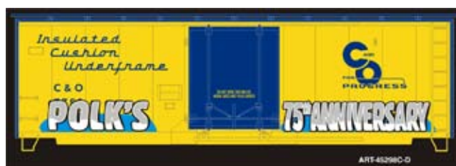
C&O "SILVER" Plug-Door Boxcar

* - Graffiti is only on one side of car.