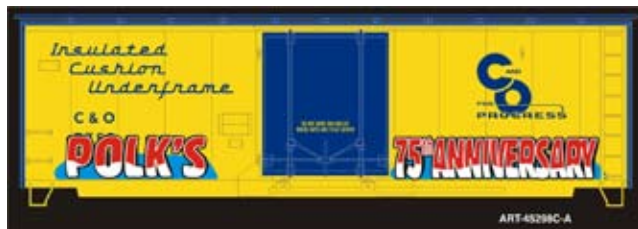
C&O "RED" Plug-Door Boxcar

Continue Your Limited Edition Collection of Aristo-Craft Trains With Four 2010 Club "Polk's 75th Anniversary" Plug Door Boxcars!