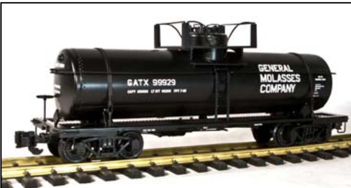
ART41337 - GENERAL MOLASSES