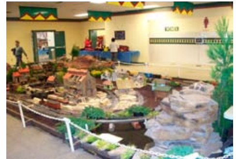
Layout on display in the entry hall at the ECLSTS

All in all, it was a great show, many old friends traded train stories and "how to do it better or easier" and we are looking forward to the Fall 2010 ECLSTS on September 24th and 25th. So mark your calendars and make your room reservations now. Remember, they have a Harley-Davidson "open house" that weekend in York and it does get crowded. The Fall ECLSTS should be a great time to see and pickup some of the new items that are scheduled to come out between now and then from various manufacturers. Hope to see you at the Fall ECLSTS.