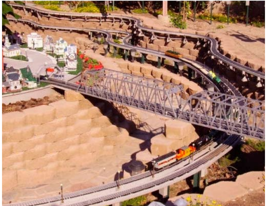
John and Gale Blessing used an adaptation of Bill Logan's HDPE Flexible Roadbed design to give their railroad wide, smooth support.

Because O gauge track is not as sturdy as Large Scale track, we recommend using a method that provides a sturdy base that supports the whole length of the track. This rules out simply laying the track on packed gravel, as some garden railroaders do. But track carefully laid on poured concrete "roadbed," on pressure-treated lumber, or on HDPE roadbed can be just fine. And all of those methods are lower maintenance in general than track