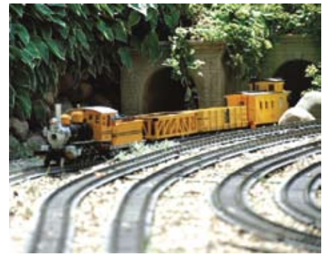
Examples of G-Gauge Railroads in action (layout - Elaine Silets)

when starting, but none are definitive enough to not allow adaptation of the other after you have found a method of operation you enjoy better than the others. For example: