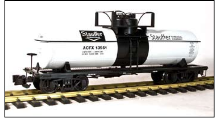
ART41338 - STAUFFER CHEMICALS