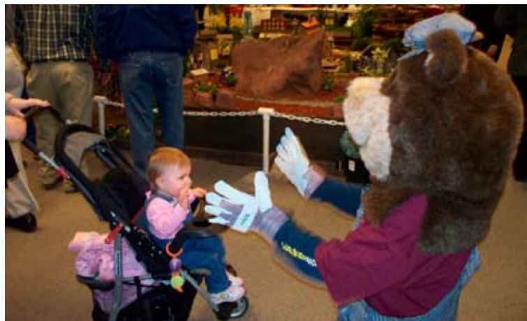
TATE greets a young fan at the show.