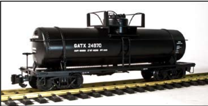
ART41335 - GATX

These new additions will be available later this summer!