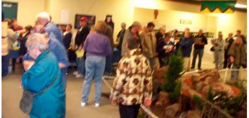
The line to get into the 2010 Spring ECLSTS show