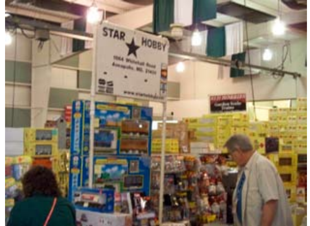
Star Hobby was one of the many vendors at the ECLSTS