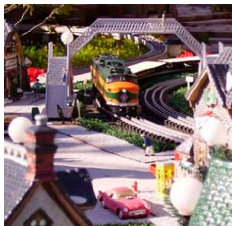
John Blessing's O Gauge Outside railroad includes Gargraves track, O scale and Christmas village accessories, and a variety of rolling stock.

Unlike Large Scale trains, which are made for garden railroads, O gauge trains are not rust-resistant or UV resis-