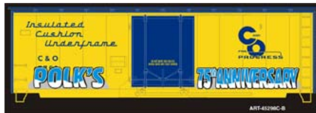
C&O "BLUE" Plug-Door Boxcar